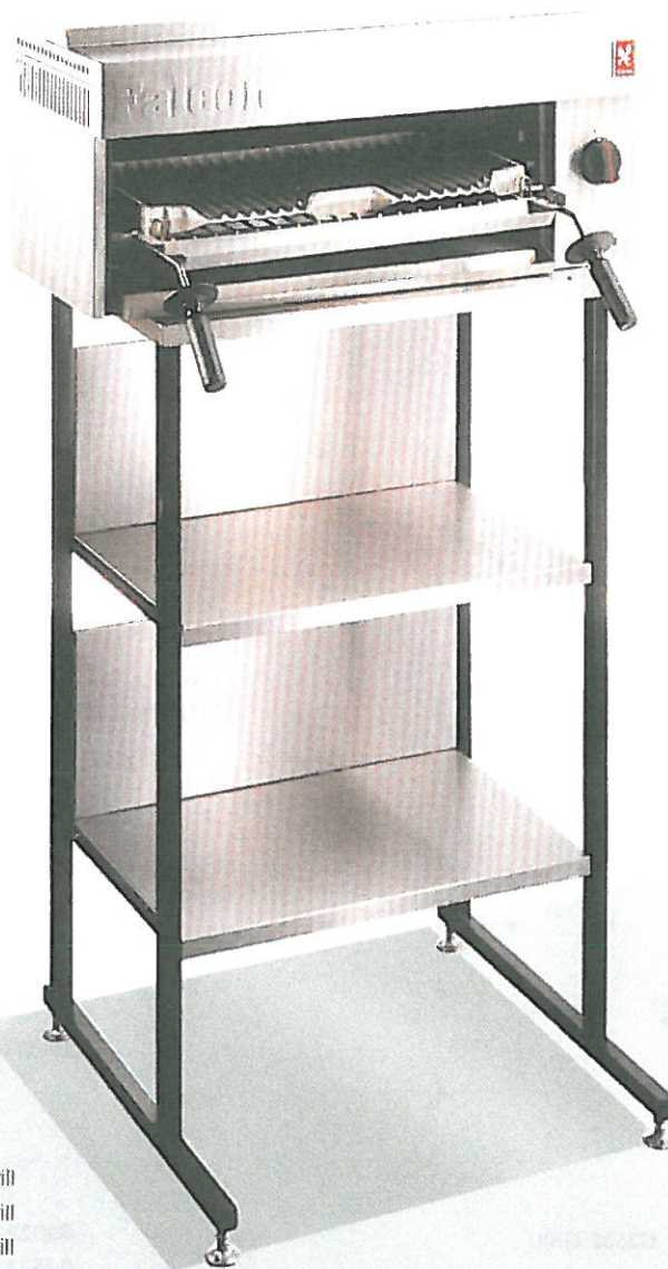
G2502 Grill G2512 Grill G2532 Grill (Shown, stand is optional) G2522 Grill