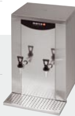
AQUARIUS 45 TT